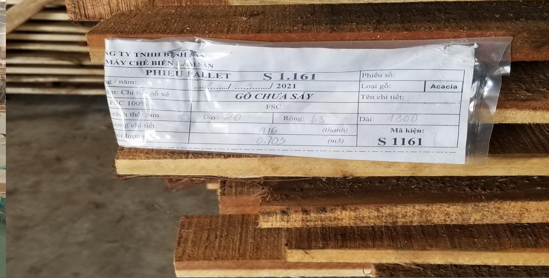
Products of the wood processing factory